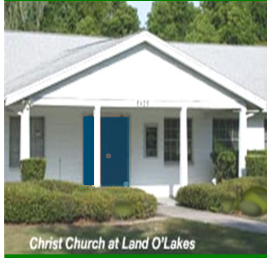
Christ Church at Land O'Lakes

Christianity is not a religion. It is a relationship with God.